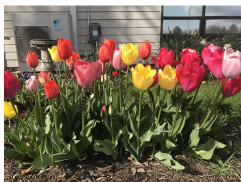
Our Flowers Bloomed